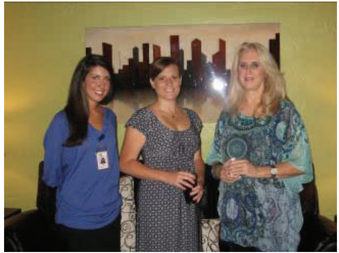
Members of the SKIRT Magazine Staff